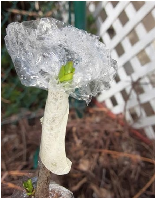
Here's an apricot grafted on plum, done with Saran Wrap and cloth tape, starting to sprout!

This was too much to take! So today I covered the grafts with some cheesecloth. Will report on how that works later. One last note, the sparrows only eat the apricot leaves and they don't touch the leaves of peach, plum, apple, etc.