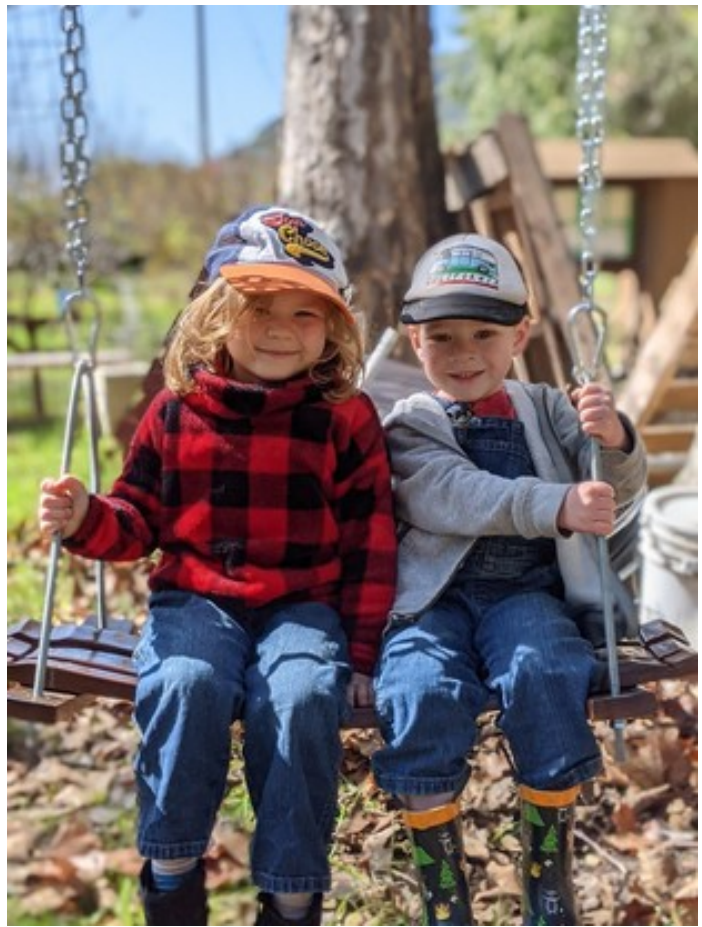
Designed for two kids

I obtained some oak wine barrel staves from a friend who was done using one of his barrels for aging hard cider. Cleaning up the staves