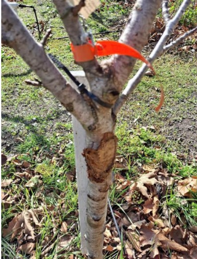
Bark infected with Gummosis removed from Minnie Royal Cherry in November

As many of you have read in past newsletters and heard about in past Zoom meetings, we had to remove the Dapple Dandy Pluot, the first ever fruit tree planted in the orchard, due to Gummosis.