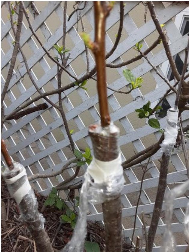
A newly emerging bit of damson plum, grafted onto a wild plum root, and wrapped in Saran Wrap.

The Saran Wrap, seemed to work fairly well, although it was harder to control when wrapping up a graft. All told I made about 50 grafts, mostly apricot, damson plum, and peach on existing plum trees. Last fall I found a very good peach tree, an obvious seedling, growing on some wild land. The peaches were very good, and the tree showed no signs of peach leaf curl. This was the peach I grafted on the plum trees.