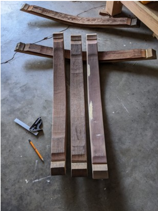
Old oak wine barrel staves