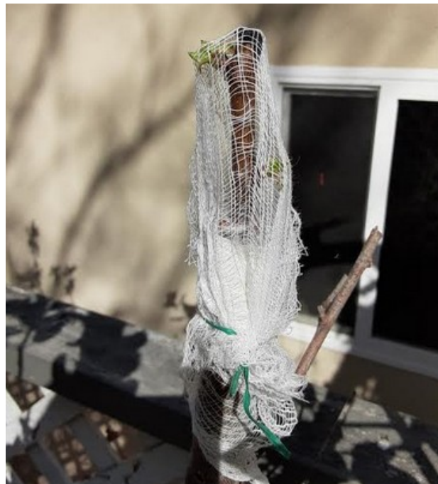
This is the same apricot graft, but the sparrows were eating all the little new leaves, so I covered it with a bit of cheesecloth. Couple of days in, and so far, so good!