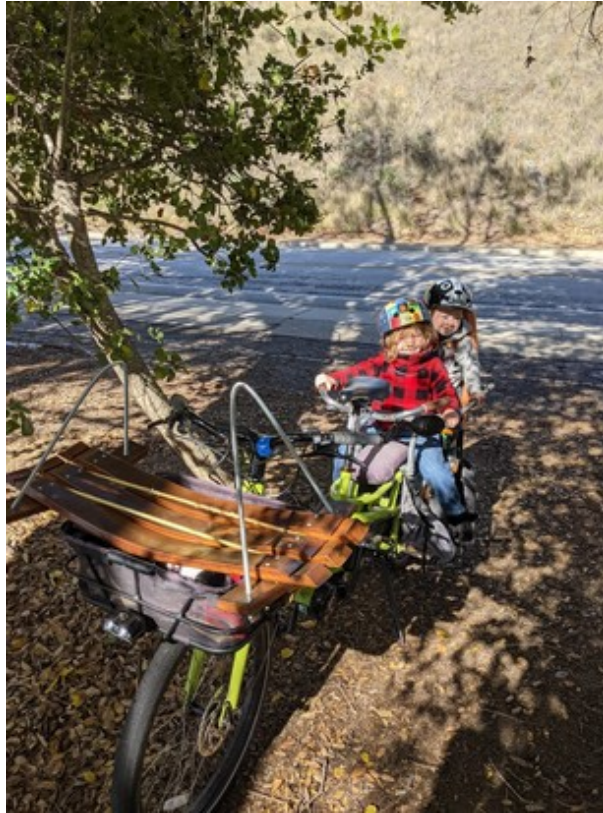
Transported swing with our cargo e-bike

using a card scraper, spokeshave, and orbital sander was the most time consuming part. I finished with a thin layer of shellac to seal the wood, followed by an oil based stain, another thin layer of shellac to act as a barrier between the oil based stain and water based polyurethane, and finally 3 coats of water based polyurethane designed for exterior furniture to protect from water and UV damage.