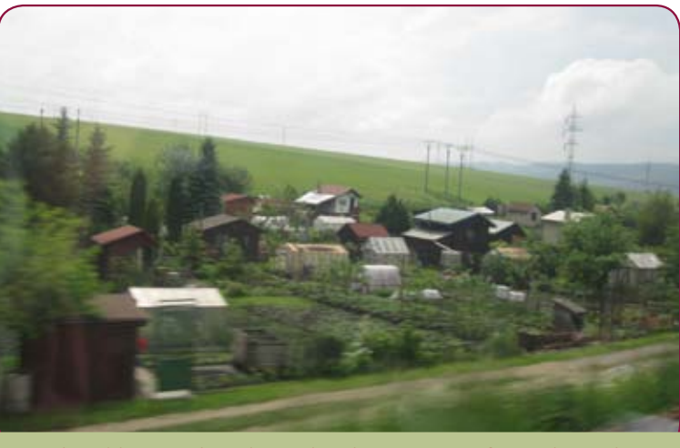
Slovakian gardens in springtime as seen from the train

Well, this is likely my last reporting from Slovakia. We fly into