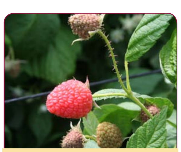
Ripe raspberry at DeBarnardi farm