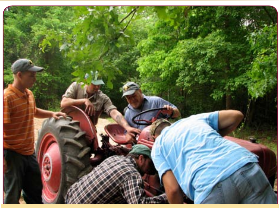
Veterans learning tractor repair and maintenance

The Farmer-Veteran Coalition is a unique marriage of farmers and food industry leaders committed to overcoming agricultural, managerial, financial, and marketing obstacles together with young veterans who have little to no experience working in the civilian world but are ready and able to apply their skills. The mission of the FVC is to mobilize our food and farming community to create healthy and viable futures for America's veterans by enlisting their help in building our green economy, rebuilding our rural communities, and securing a safe and healthy food supply for all. They do this through career development, educational farming retreats, mentoring by experts in business planning, production and marketing; fellowships and in-kind donations of seed, fertilizers, irrigation supplies, farm equipment, and breeding