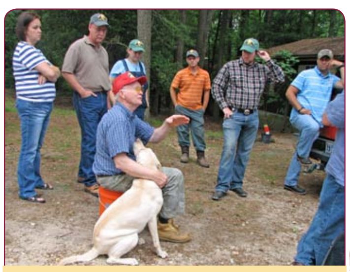
A farmer conveys his knowledge to veterans

friendly packaging and methods, and using solar powered equipment. A recent FVC fellowship applicant has plans to not only have an organic farm in the inner city, but to also use biofuel for the delivery vehicles. Another recent grantee stresses the importance of adding