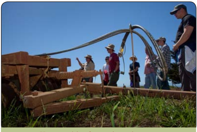
Veterans visit a farm to learn the ropes

Unemployment numbers for young veterans are daunting, with many unable to transfer their military skills to viable civilian employment in an already burdened market. Many of these veterans return home to rural communities far