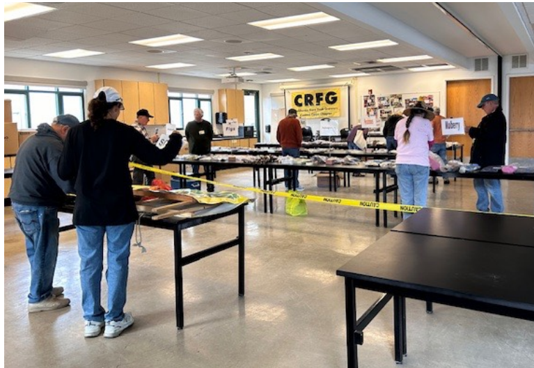
Members working hard to prepare before the doors open!