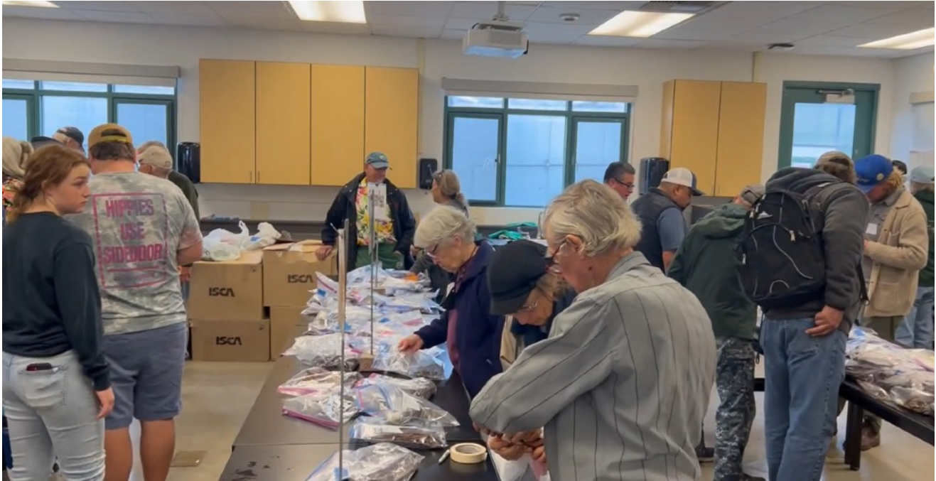
Above and Below: More browsing through scions!