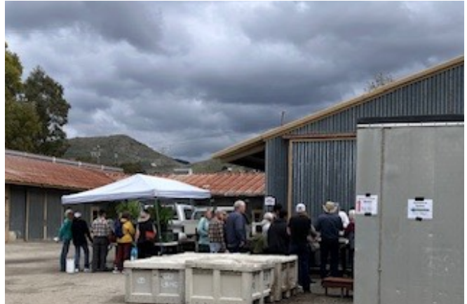
Below: The outdoor grafting demonstrations.