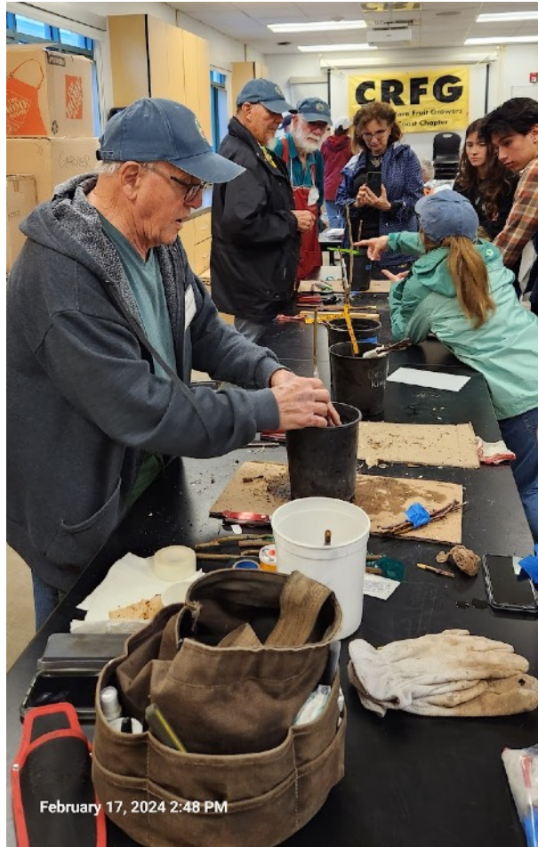
Above and Below: Indoor grafting demonstrations.