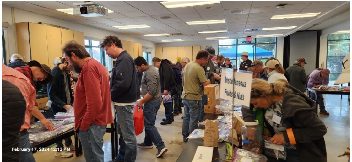
Right and Below: Browsing through scions.