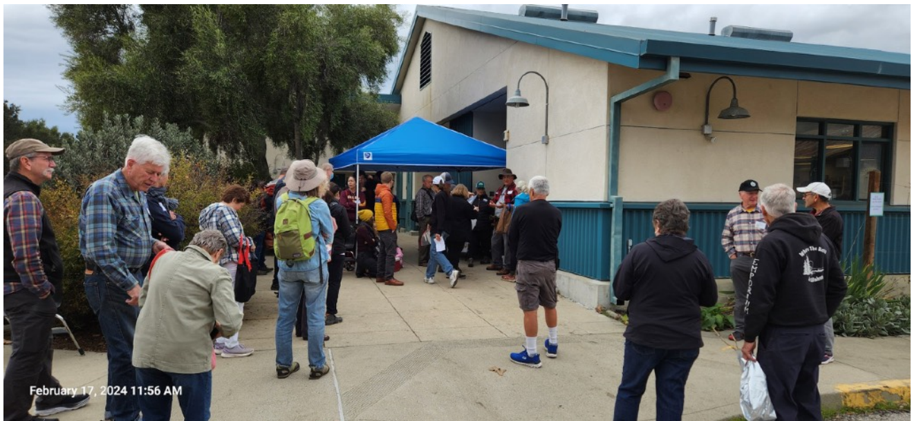
Below: A crowd forms waiting for the doors to open.