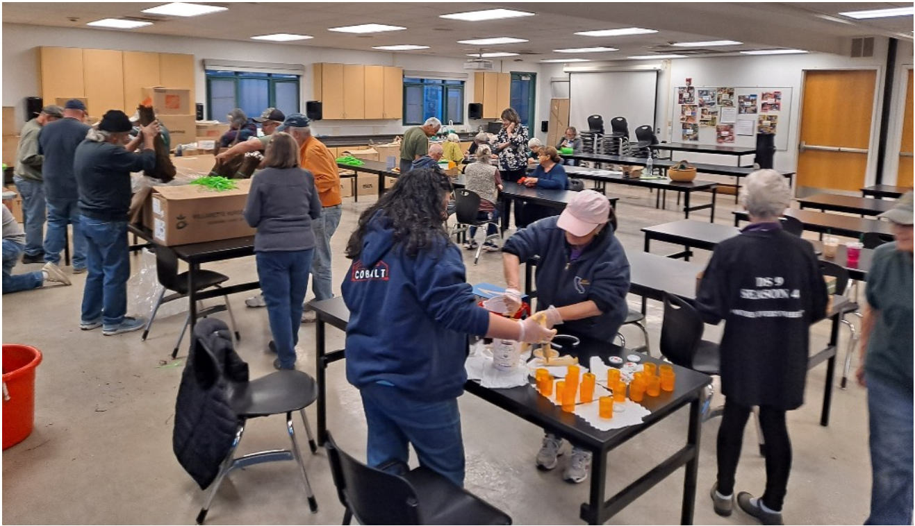
Members work to separate rootstocks, fill bottles with grafting goop, write rootstock labels, and make parking signs.