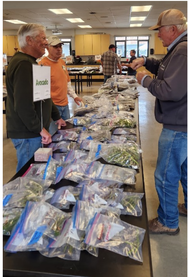
Above and Below: The doors are open and the exchange begins.