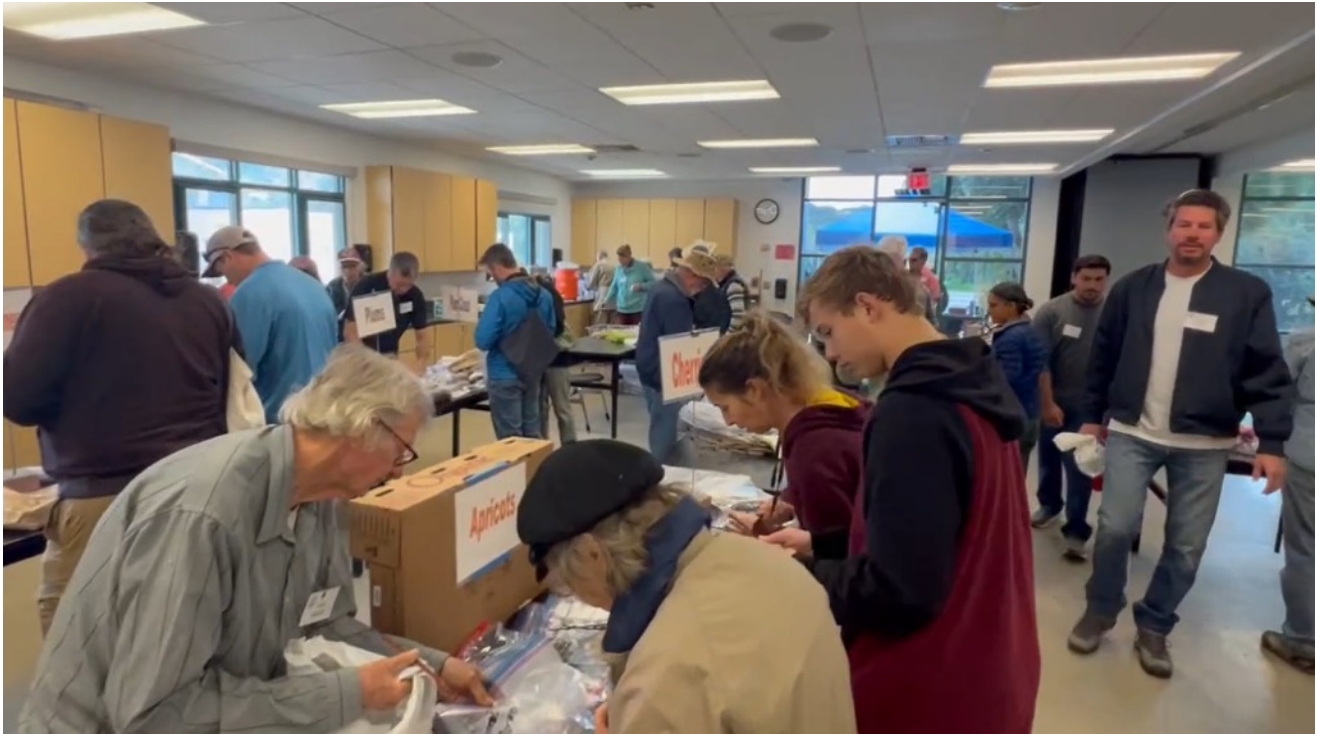
Above and Below: More browsing through scions!