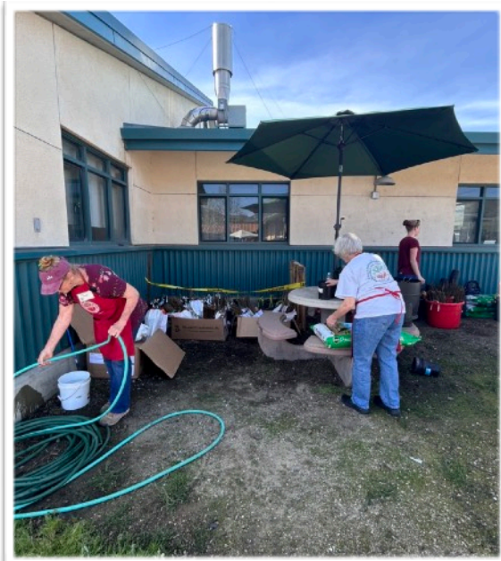
Preparing the rootstock for sale - Photo by Erica Williams