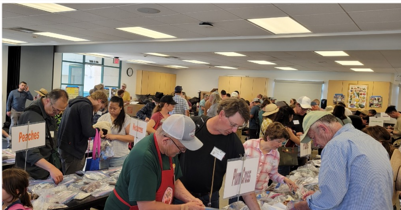
Scion exchange in full swing!