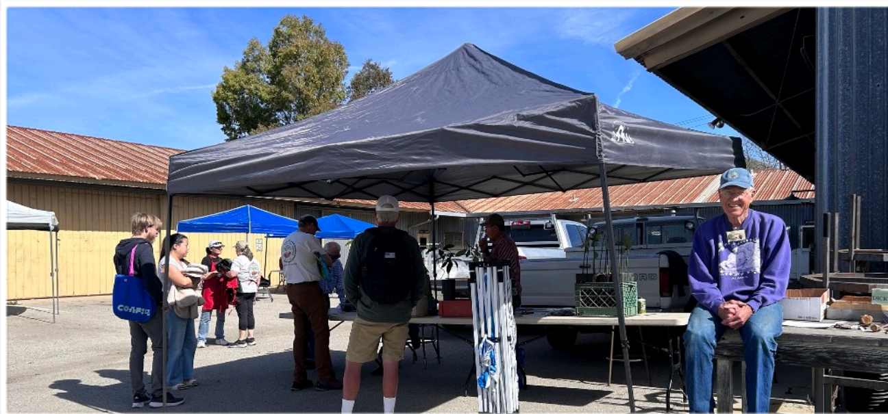
Setting up to demonstrate grafting