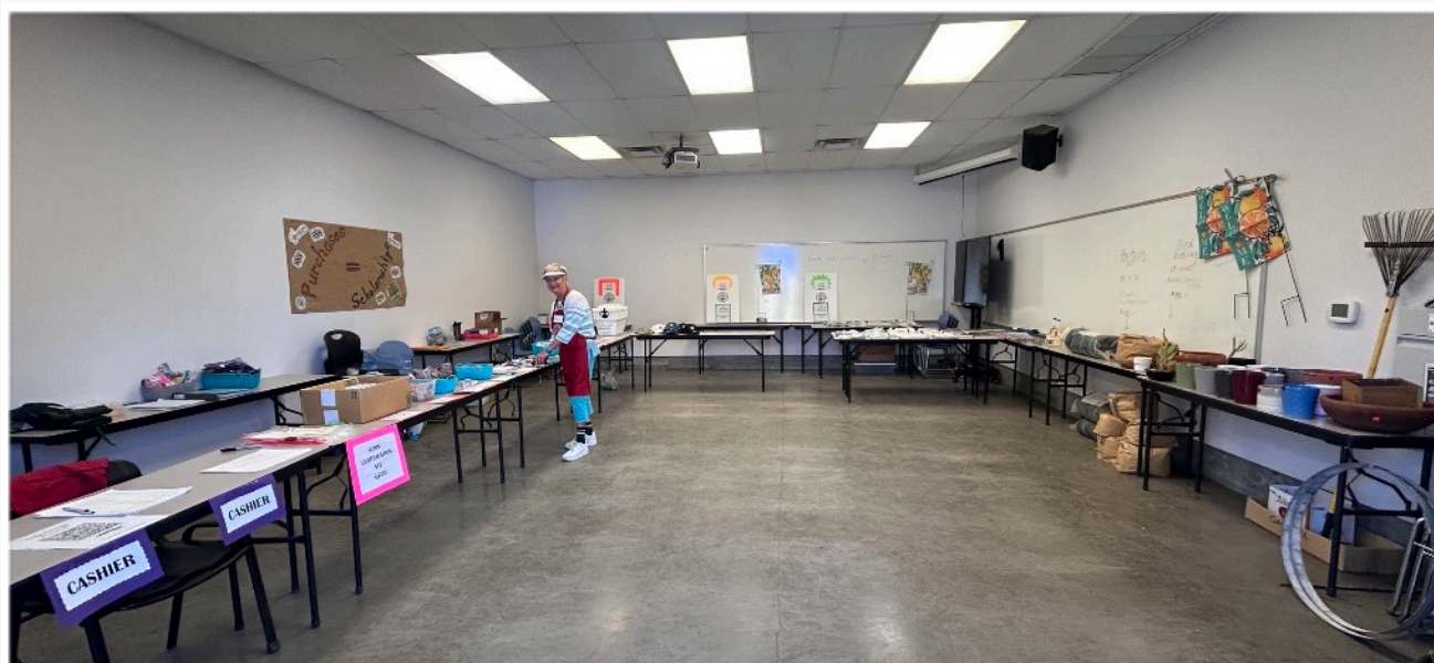
The store is ready to go!