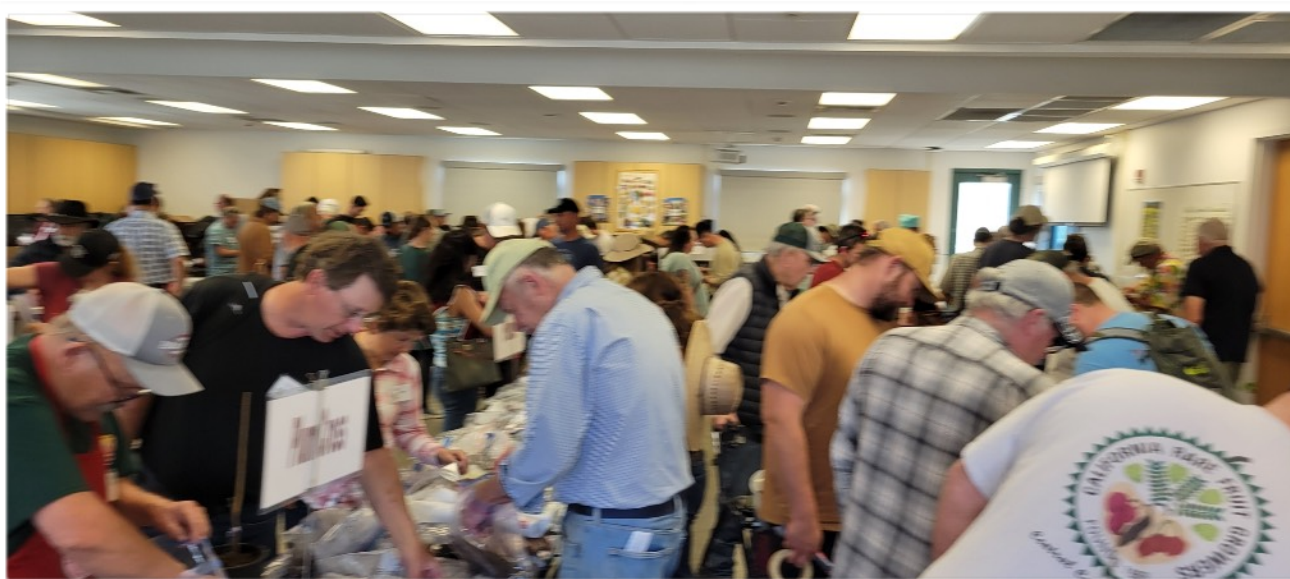
People browsing the available scions