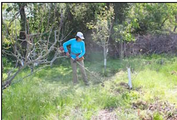
Dara also took a turn at whacking those weeds.