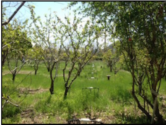
Lots of weeds greeted us when we arrived at the orchard this morning!

A very productive work day this morning!!!