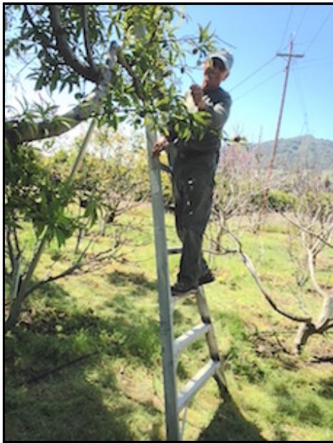
Larry says he filled three 5 gallon buckets with the thinned fruit, and there is still more to go!