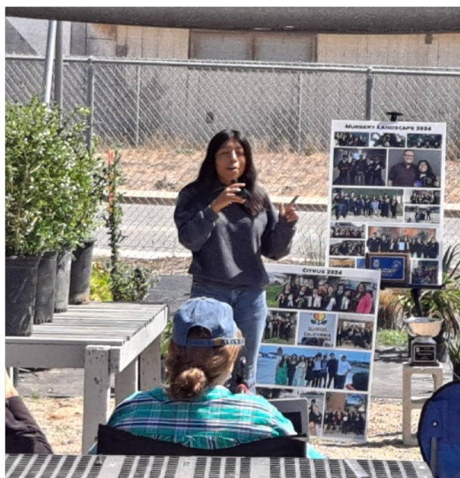
Lexus talks about judging plants