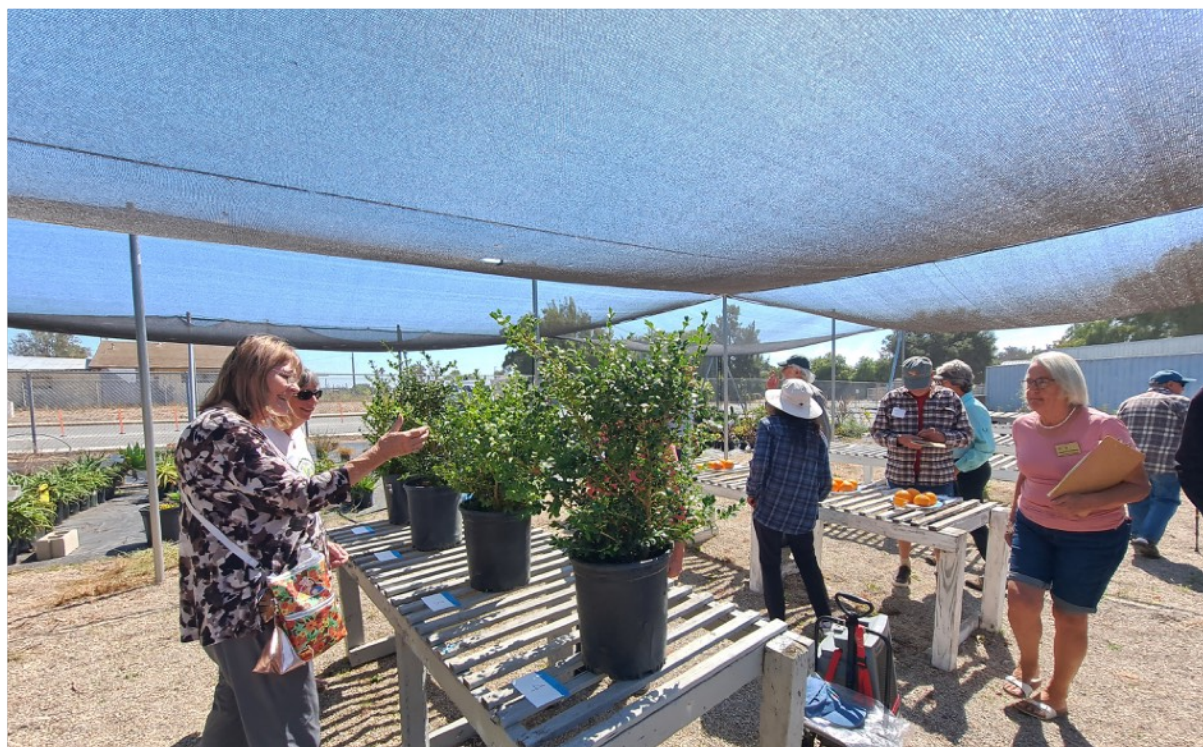
Meeting attendees judge plants and citrus