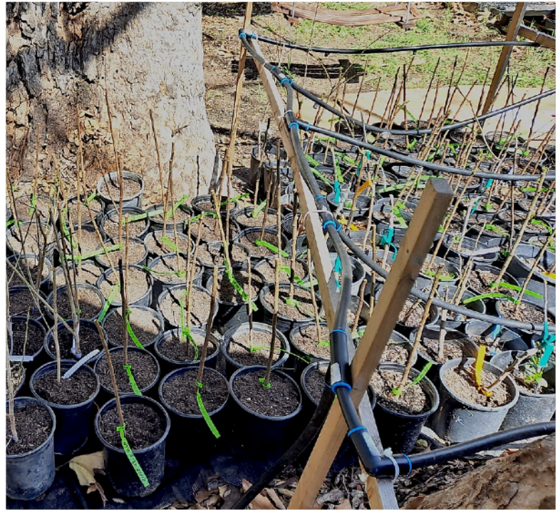
Rootstock ready for sale

Produces a standard sized tree (10 – 15 ft). Is very robust and adapts to all types of soil. Mariana produces good crops of plums, but doesn't anchor well when it is young and tends to produce root suckers. It resists root knot nematodes, root asphyxia, oak root fungus, crown gall, and prune brown line, but is susceptible to bacterial cankers.