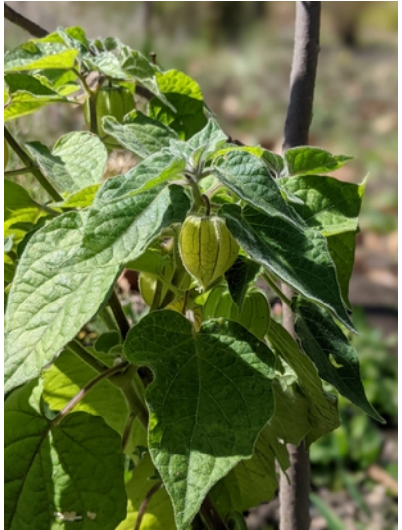
Unripe Goldenberry on bush