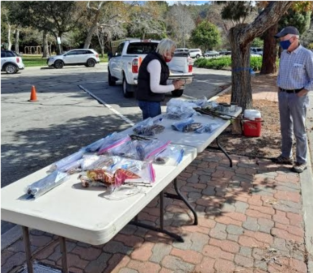
The scion exchange table early in the setup process

Several yards away was the scion exchange table, with its Ziploc bags of scion wood. Gabrielle set up and organized the scion bags.