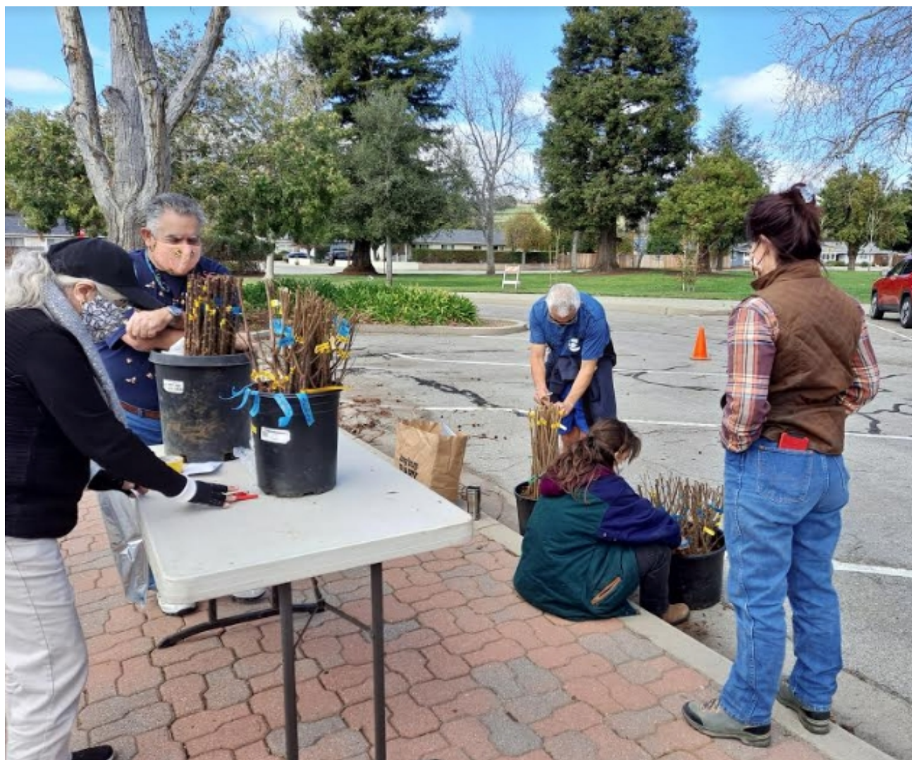
Volunteers help label individual rootstock for sale

All in all, approximately 40 people came to the sale. Lots of information was exchanged about personal experience with fruit trees, grafting and propagation techniques.