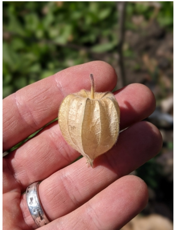
Goldenberry found on ground under bush