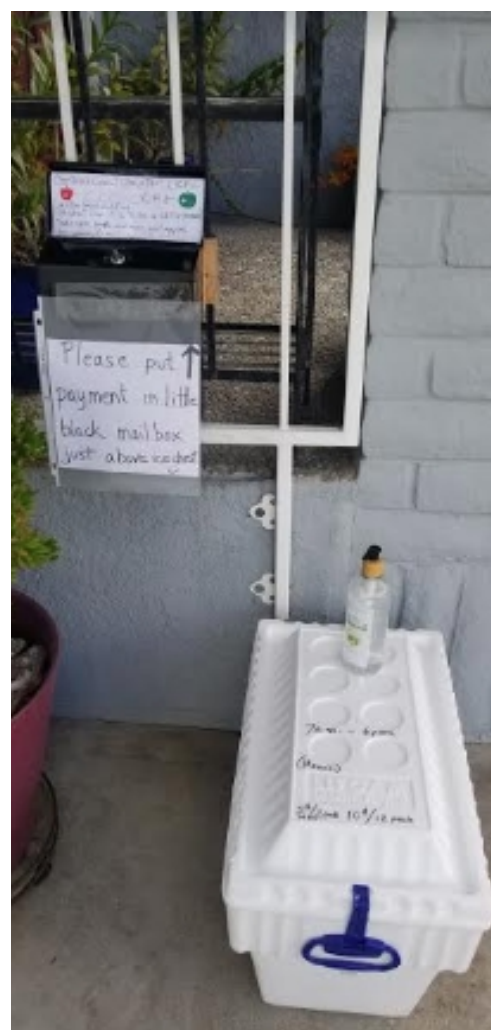
Pheromone loops in cooler outside Jenny's house, and locked mailbox ready to receive payments

Saturday, March 13 th turned out to be a beautiful sunny day. Volunteers showed up at noon and set up tables. They individually labeled the rootstock brought by Joe, and sold it at one table.